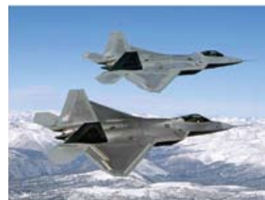
Used on both military and commercial aircraft to defend hose systems from fire and thermal events.