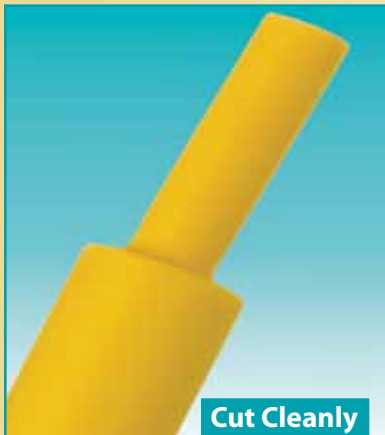
Cut Cleanly Scissor