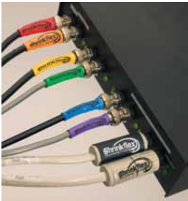
Shrinkflex works great for color coding and wire harnessing applications.

When economy is the driving force, 2:1 Shrinkflex heatshrink tubing is the answer. Not as versatile as a high ratio shrink product, 2:1 will still slide easily over small inline splices and connectors and provide a tight seal in many applications.