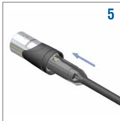
Align the key of the insert with the keyway on the shell then push the pin insert & cable clamp together in the shell.