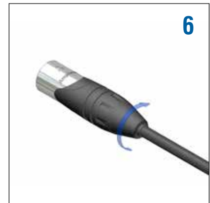
Thread the nut (Backshell) onto the shell (Torque 0.8Nm - 1.2Nm) to activate the cable clamp and close the connector assembly.