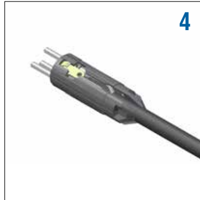
Install the cable clamp flush to the insert making sure to align the slot with the ground contact.