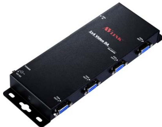
1 In 4 Out