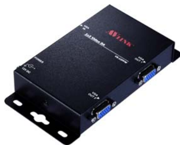
1 In 2 Out