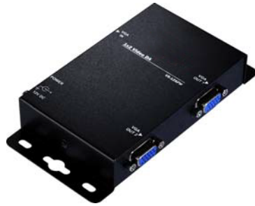
1 In 2 Out