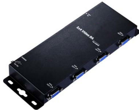
1 In 4 Out