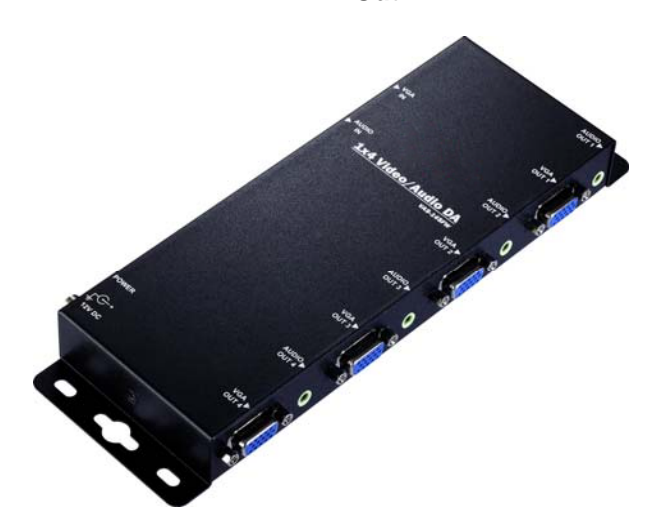
1 In 4 Out