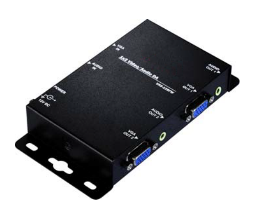
1 In 2 Out