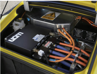
Tomorrow's electric vehicles are more compact with higher power. Flex Glass FR is designed to control up to 7,000 volts in tight spaces safely and efficiently.

SF sleeving is rated to 392°F. (Class H), is abrasion resistant, and maintains its flexibility in low temperature environments. SF is available in a very wide range of sizes, and is ideal for use in appliance assemblies, wire harnesses, transformer leads, power supplies, motor coil, and heater leads.