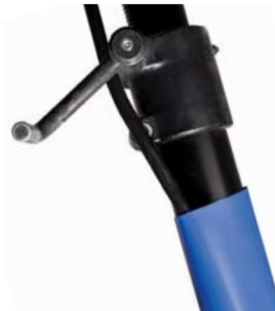
Studio Key Sleeve works great for temporarily covering valuable light booms and stationary poles.

Blue/green screen was originally invented as a film technique to separate the actors and composite them over another background. The reason both green and blue are used because they are the least prominent colors in our skin tone. The goal in using a green or a blue screen is to isolate the subject.