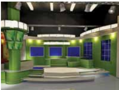
Whether your studio is set up for green or blue, reversible Key Sleeve has you covered.