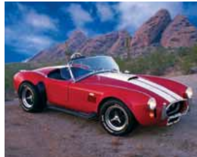
High end automotive applications have always used stainless steel hoses for looks, protection and durability.