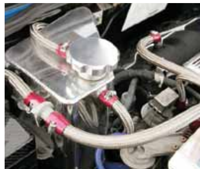
Stainless Steel XC gives a full coverage on any application and slides onto hoses for that custom look.