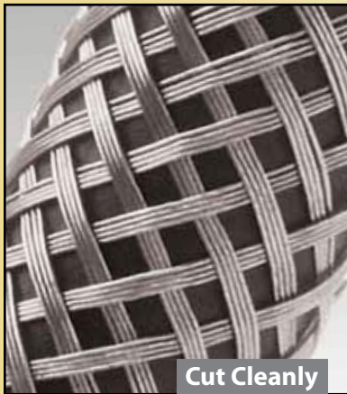
Cut Cleanly Shears